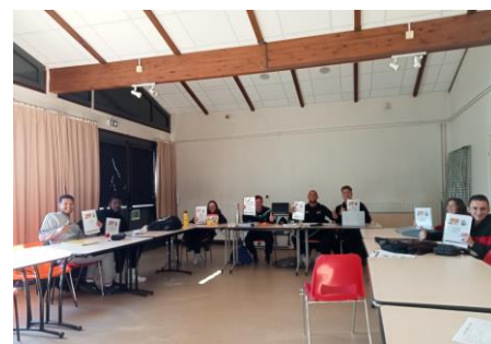
Multiplier events in France